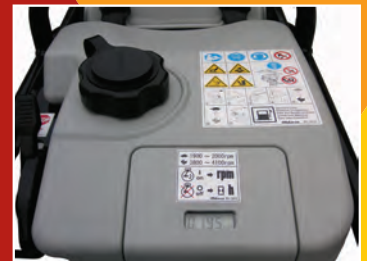
3-LITRE FUEL TANK