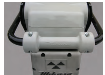
EASY LOAD HANDLE ROLLER