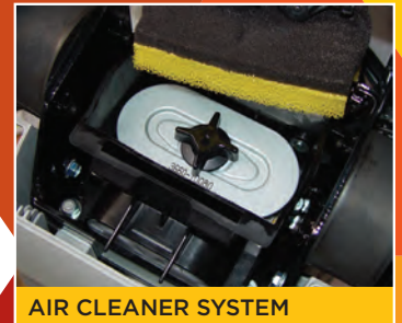
AIR CLEANER SYSTEM