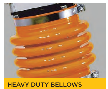
HEAVY DUTY BELLOWS