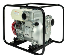
Semi Trash Pumps